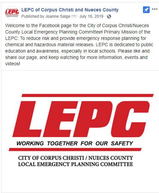
Pinned Post - Mission Statement