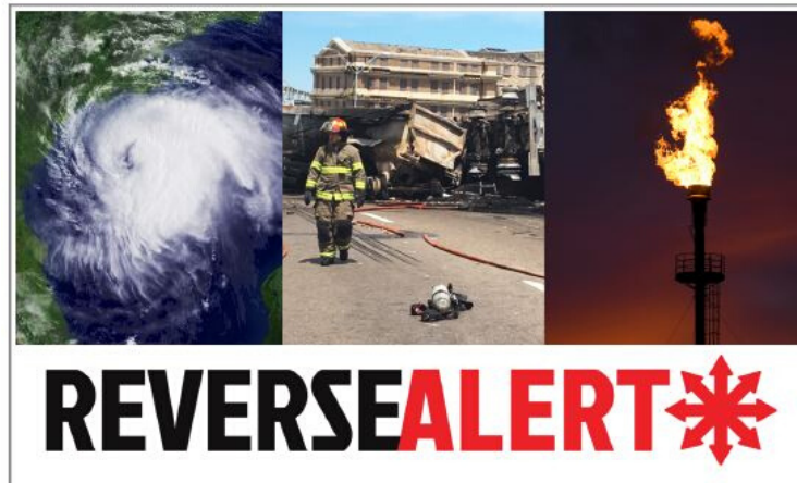
Reverse Alert Information Card