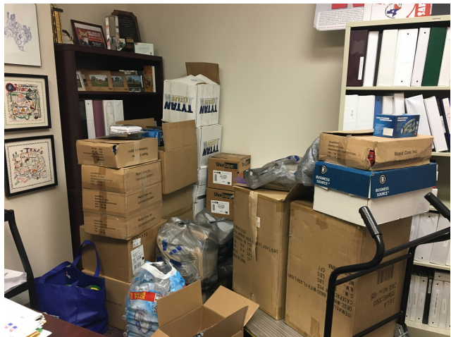
Preparing Shelter-in-Place kits