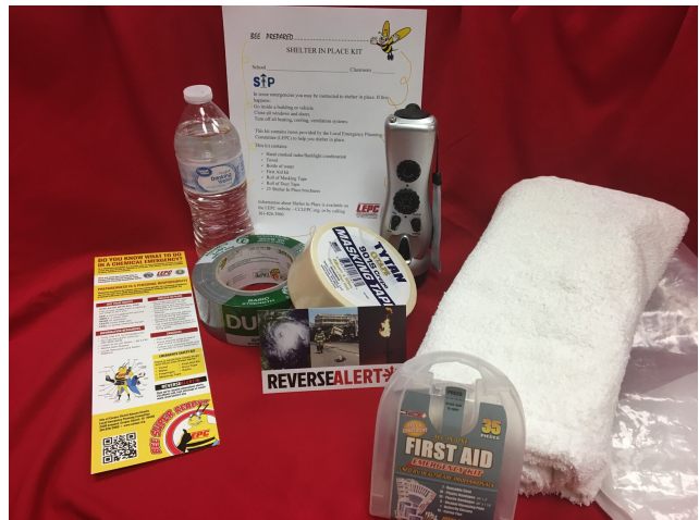
Completed Shelter-in-Place kit