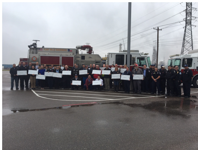
Flint Hills Resources Helping Heroes Grant Fund Check Presentation