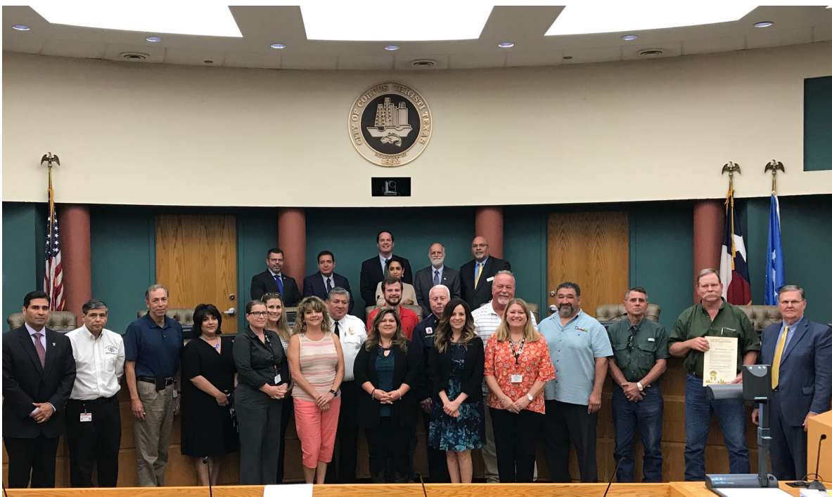
Safe Digging Month Proclamation by the Corpus Christi City Council and Mayor