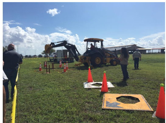
Safe Digging Seminar 2019