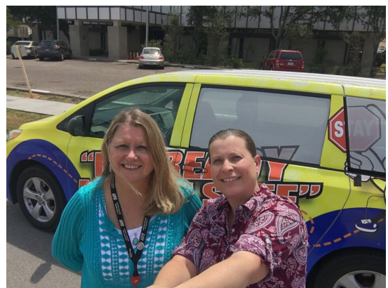
City Hall Selfie Day