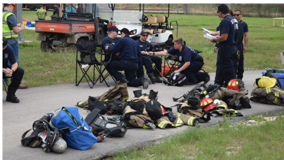
Rail Car Safety Training with Union Pacific Railroad at O.N. Stevens Water Treatment Plant